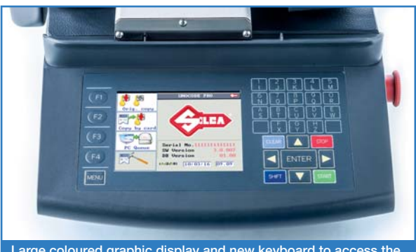
Large coloured graphic display and new keyboard to access the software integrated in the machine

exclusively for profess from Silca S.p.A. Any