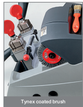
Tynex coated brush

The de-burring brush is Tynex coated to ensure uniform abrasion and a perfectly finished key.