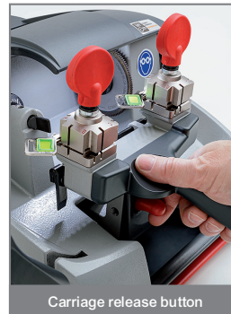
Carriage release button

The clamps can be quickly and smoothly turned without first needing to be removed thanks to the unique, patented rotation system. The clamps are tightened with ergonomic handles with a ball bearing system to fix the key perfectly without damaging the clamp. The clamps made from sintered metal with a protective nickel coating for strength and durability.