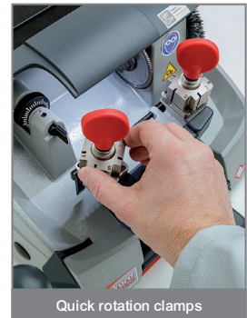
Quick rotation clamps