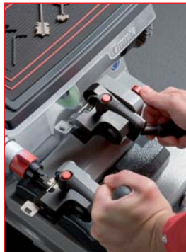
Smooth carriage movements

Silca is always close to its partners. The QR Code attached to the machine's side enables you to watch useful tutorial videos directly on your smartphone, helping you out with maintenance operations and installation of optional accessories.